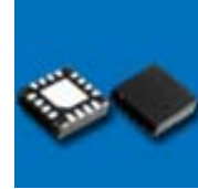
3mm*3mm QFN 16L -40°C ~ 85°C

The CP2130 is optimized for white LED supplies in backlit color display applications. The device provides a constant current, set by an external resistor, for each LED. The supply voltage ranges from 2.7 V to 5.5 V and is ideally suited for all applications powered by a single LI-Ion battery cell or three to four NiCd, NiMH, or Alkaline battery cells. The CP2130 provides up to 30 mA per LED, for a total of 150 mA, for input voltages ranging from 3 V to 5.5 V. High efficiency is achieved by utilizing a 1x/1.5x adaptive fractional conversion technique in combination with very low dropout current sources. Only two external 1 \mu F and two 0.47 \mu F capacitors are required to build a complete small and low cost power supply solution. The CP2130 switches at 1 MHz operating frequency and is available in a small 16-pin QFN package to keep board space to a minimum.